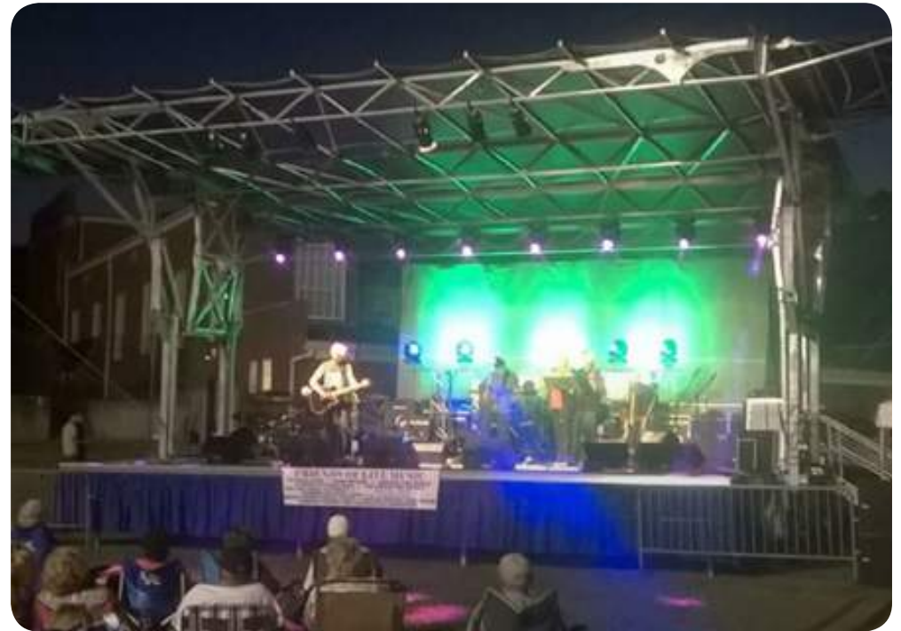
Proposed new mobile stage

There are no additional funding sources for this phase of the Courthouse Park project.