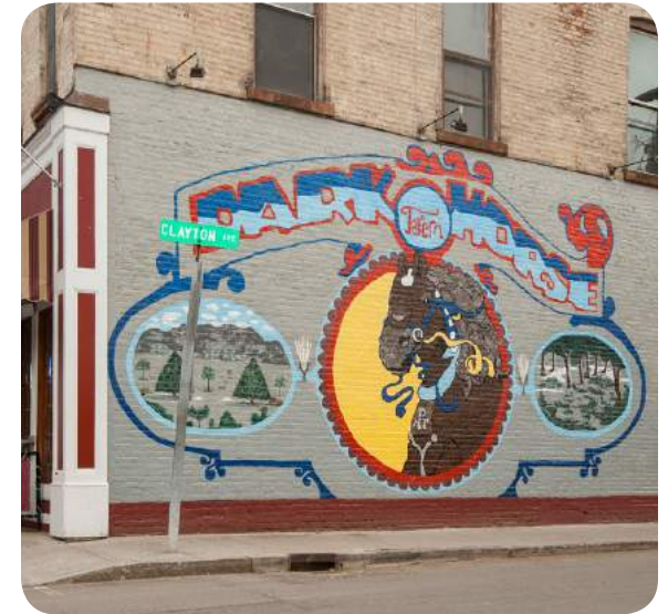
Mural on the side of the Dark Horse Tavern

City of Cortland is named as primary sponsor for the following reasons: the anticipation that art will be installed on public property, the city's capacity to administer funds, and the importance of integrating this project with other infrastructure improvements, for which the city is ultimately responsible.